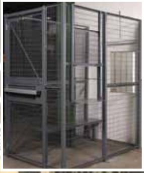
PARTITIONS & CAGES

Machine Guarding Systems are a simple, effective way to protect and separate personnel from the dangers posed by automated equipment.