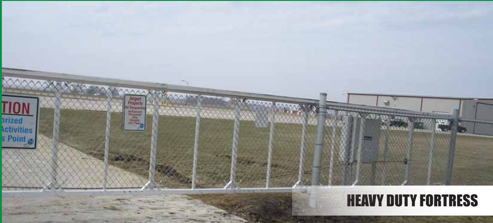
HEAVY DUTY FORTRESS

Count on Midwest Fence & Gate and Tymetal to provide you with a stronghold of security for years to come.