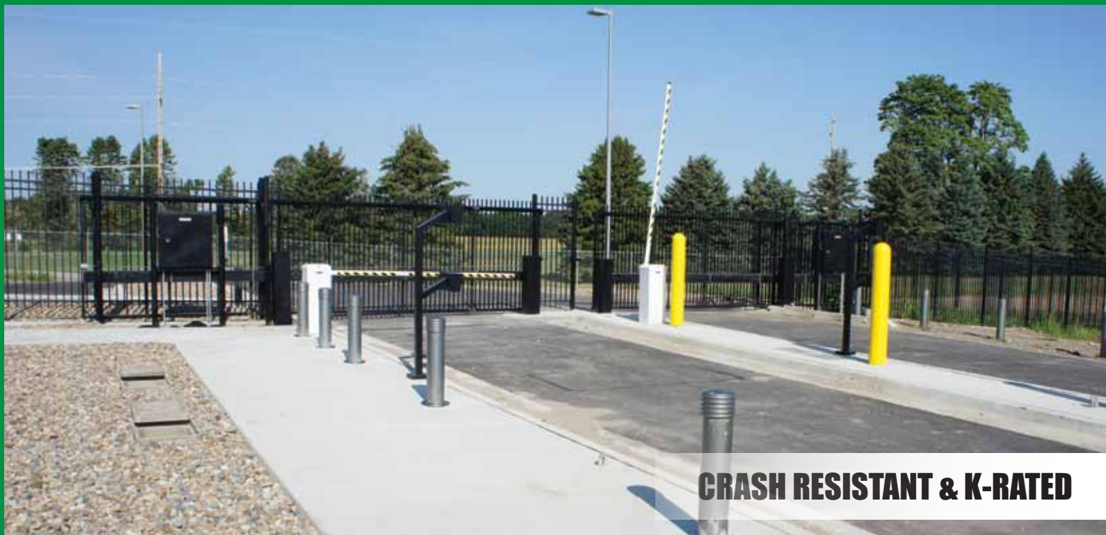
CRASH RESISTANT & K-RATED