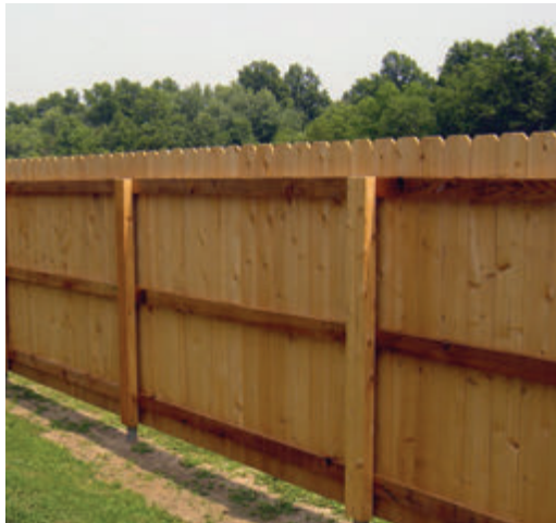
SOLID WITH POSTMASTER